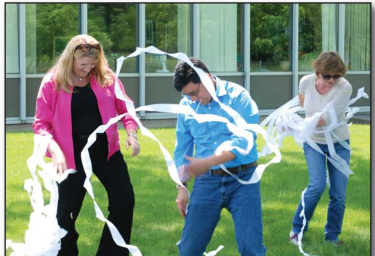
BBT staff relieved some stress by enjoying some fun games in the warmth of last summer's sunshine.